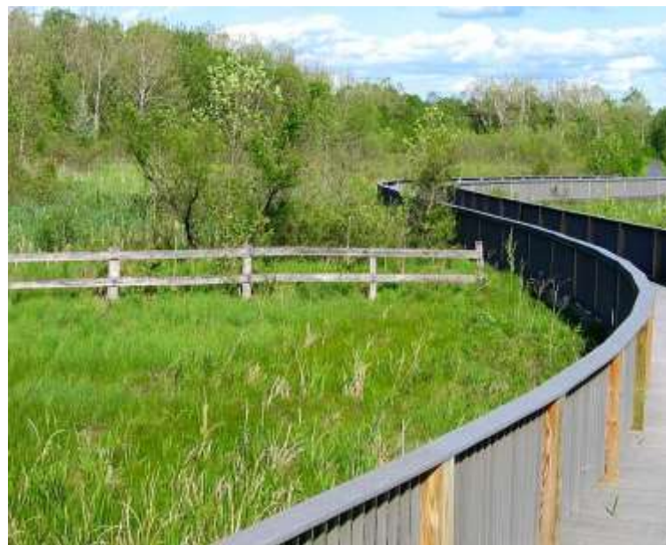
Abrams Creek Wetlands Preserve

The Abrams Creek Wetlands are home to many rare plant species and ecological communities, and they are a distinctive wetland site in the Shenandoah Valley. The wetlands encompass nearly 60 acres that have been an area of interest to the Virginia Natural Heritage Program (VNHP) since 1980, when ecologists made the first of several visits. Since 1998 Shenandoah University faculty and staff in the Environmental Studies Program have been studying this site in collaboration with the VNHP. In October 2003, Winchester established the 25 acre Abrams Creek Wetlands Preserve . Our leader will show us the special features of the preserve and tell us about the past and ongoing studies of the plants that inhabit the Wetlands. Easy walk, mostly on paved surface, although seeing some plants may require stepping off into moist areas or higher vegetation.