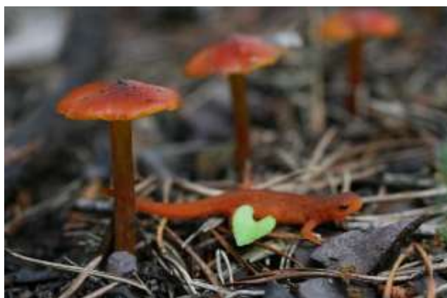
Waxcaps ( Hygrocybe ) with newt

Explore the hardwood forest of Shenandoah River State Park , finding and identifying mushrooms living there. This is an easy walk.