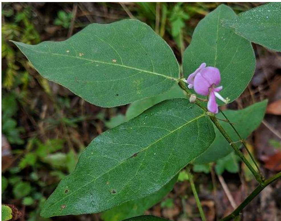
Dillens Tick-trefoil ( Desmodium glabellum )

Walk near the Bear Wallow parking lot near Massanutten Mountain, part of the George Washington National Forest . This area offers a variety of terrain, varying from dry and sandy habitat to a stream passing through a peat bog. It has many interesting plants and fungi.