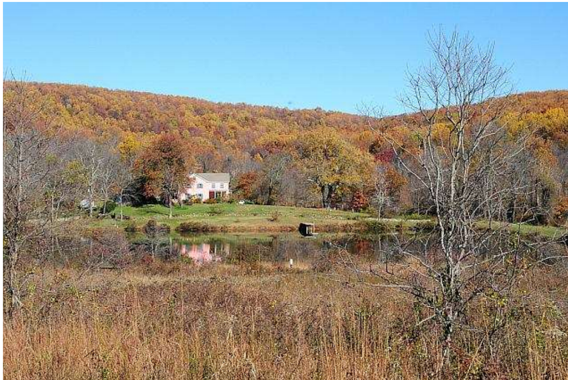
Clifton Institute

The Clifton Institute is a living study and outdoor classroom of the ecology of 900 acres of Clifton Farm in the northern Virginia Piedmont. Tour a mosaic of different habitat types (upland forest, meadow, shrub field, wetland, vernal pool, stream, and pond), each of which is home to a different community of plants and animals. See restoration projects in different stages, including one of the richest native meadows in the region.