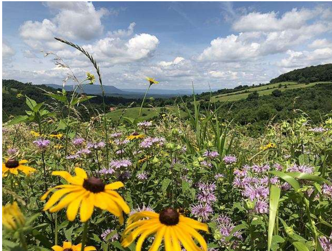
Native Meadow Demonstration Plots at SCBI RaceTrack Hill

The Smithsonian Conservation Biology Institute (SCBI) is a leader in the global effort to save wildlife species from extinction and train future generations of conservationists. This tour includes a 3 hour driving excursion of the property, visiting the Virginia Working Landscapes demonstration ecology plots, an American Chestnut breeding orchard, and homes of cheetahs, Przewalski's horses, Addra gazelles, Hartmann's mountain zebra, Scimitar-horned oryx, Eld's deer, and Red Crowned and Whooping cranes.