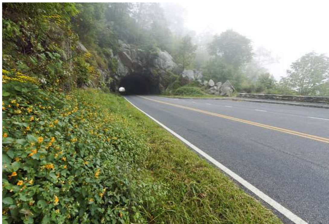
Shenandoah National Park Tunnel Overlook

Cruise along a 24 mile caravan trip through Skyline Drive , featuring easy walking on flat, roadside terrain. Beginning at Dickey Ridge, several stops will be made to observe beautiful vistas and roadside flora, and to discuss the geology that makes this area unique. The tour culminates at Elk Wallow Wayside.