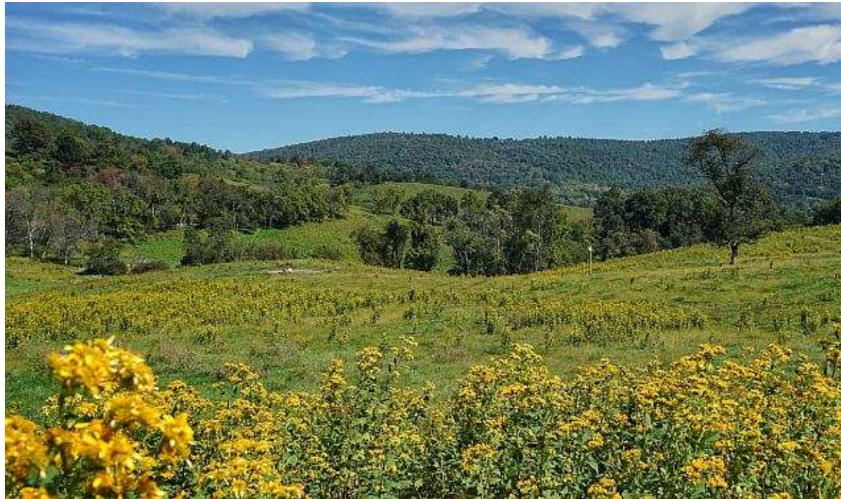
Sky Meadows State Park

Explore a 76 acre area within Sky Meadows State Park used by Master Naturalists and park volunteers for botany training, monitoring vernal pools and bluebird boxes, and educating park visitors. The area includes pollinator plots and a trail for visually impaired visitors.