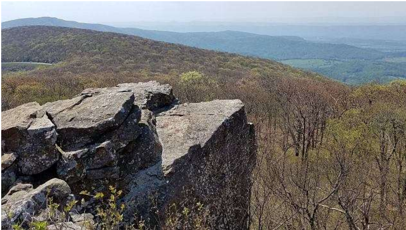
View From Marshall Peak Shenandoah National Park

Hike up North Marshall peak in Shenandoah National Park's Northern District. The hike will be out and back, one-half mile each way, with an elevation gain of 400 feet on the way out. The destination is an outcrop with great views. Steve will discuss the Park's Rock Outcrop Management Plan and plants along the way. The hike is considered moderate because of elevation gain and rocky uneven footing.