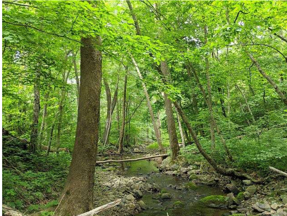
Jeremy's Run at Shenandoah National Park

Enjoy the special beauty of Shenandoah National park with an active woodland hike. The trail starts at Skyline Drive and crisscrosses Jeremy's Run, a tributary of the Shenandoah River, multiple times. The trail provides a particularly lovely setting and a nice selection of forest flora. This is an easy hike with only moderate elevation change but hiking poles are advised for fording the creek on stepping stones.