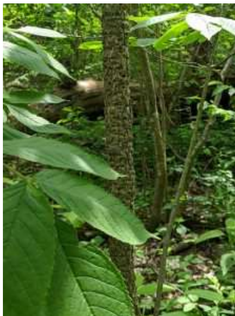
Black Ash at Thompson WMA

Journey into the rare habitat within an upland forest seep in the G. Richard Thompson Wildlife Management Area (WMA). The cool microclimate of this feature, called a Central Appalachian basic seepage swamp, supports a number of plant species normally seen in the north, including Black Ash ( Fraxinus nigra ). Prepare for some bushwhacking and muddy conditions to see this exceptional area.