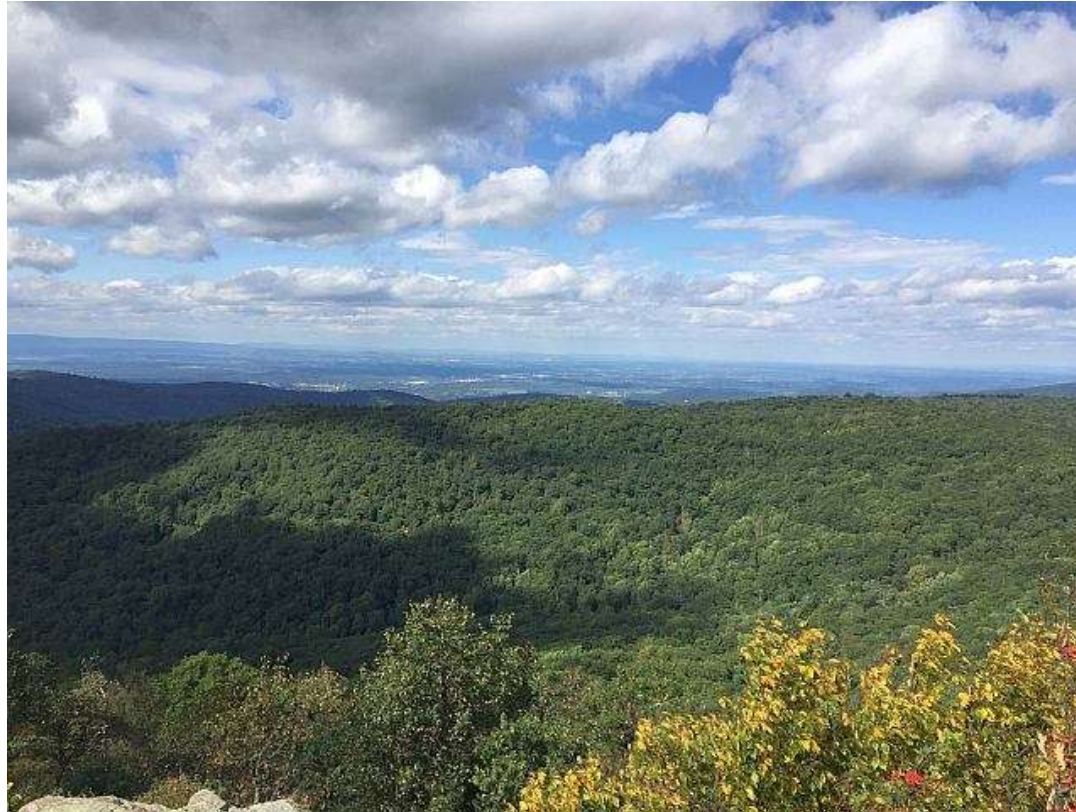
View from Compton Peak in September

Hike along the Appalachian Trail in Shenandoah National Park, stopping for a variety of plants. We will first head to the top of Compton Peak with a fantastic view of the Shenandoah Valley and the mountains to the west. Then, a spur trail will take us steeply down hill to see some basalt columns, one of the best geological features of the park. This hike is about 2.5 miles round trip and has 850 feet of elevation gain.