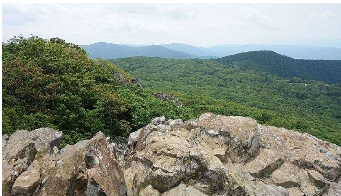
View From Stony Man Outcrop Shenandoah National Park

The hike will be a total of 3.5 miles, and we will cross Little Stony Man on the loop.