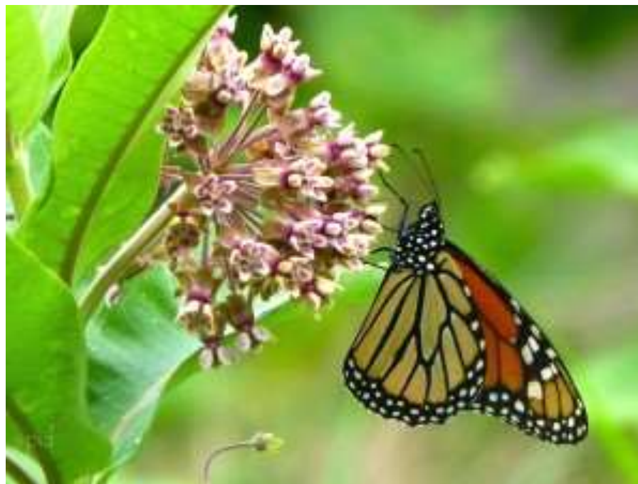
Asclepias incarnata with Monarch butterfly

In this workshop we will focus on monarchs—their biology, life cycle and population status—and on the great varieties of other critically threatened pollinators, the reasons for their decline and the importance of native plants to their survival. A walk through Blandy's pollination garden, the native plant trail, and community garden will follow a presentation and discussion.