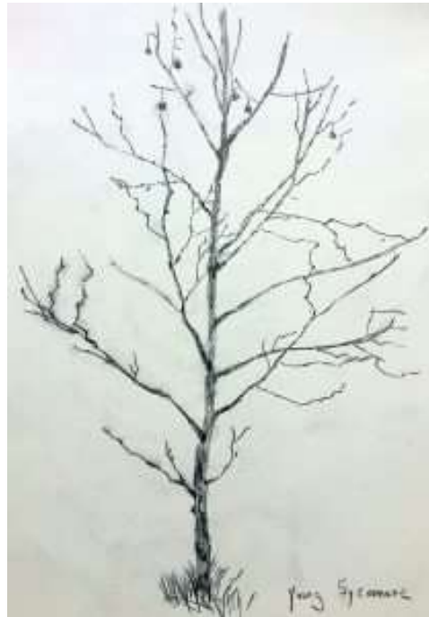
Young Sycamore Drawing by Susan Sharpe

Approximately one hour of lecture and exercises will be followed by a guided outdoor excursion. Drawing materials will be available, but participants may wish to bring their own. Sketch pads, pencils, pens, colored pencils and watercolors will be discussed. Beginners are welcome, as well as more experienced artists.