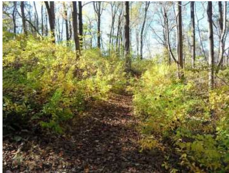
Wildcat Mountain Loop Trail

This field trip includes sites of special botanical interest within the The Nature Conservancy's 699 acre Wildcat Mountain Natural Area in Fauquier County's inner Piedmont. This is an area of natural beauty and good botany, predominantly oak hickory forest communities, with altitude ranges between 500 and 1200 feet. As a geological monadnock of basic rock, its vegetation is more allied with the Blue Ridge than that of the surrounding Piedmont. Numerous exposures of weathered, Precambrian greenstone (Catoctin metabasalt) occur throughout. Humus-filled crevices provide footholds for many specialized and rock-loving species. The preserve has been temporarily closed to public access but is open to us by special permission.