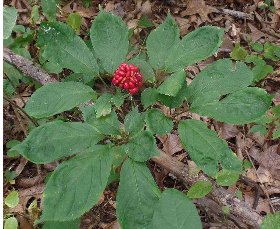
American Ginseng ( Panax quinquefolius )

Explore the different habitats of this botanically rich trail and learn about Shenandoah National Park's ginseng protection program. The one-half mile loop trail is mostly gentle with some short, very steep places.