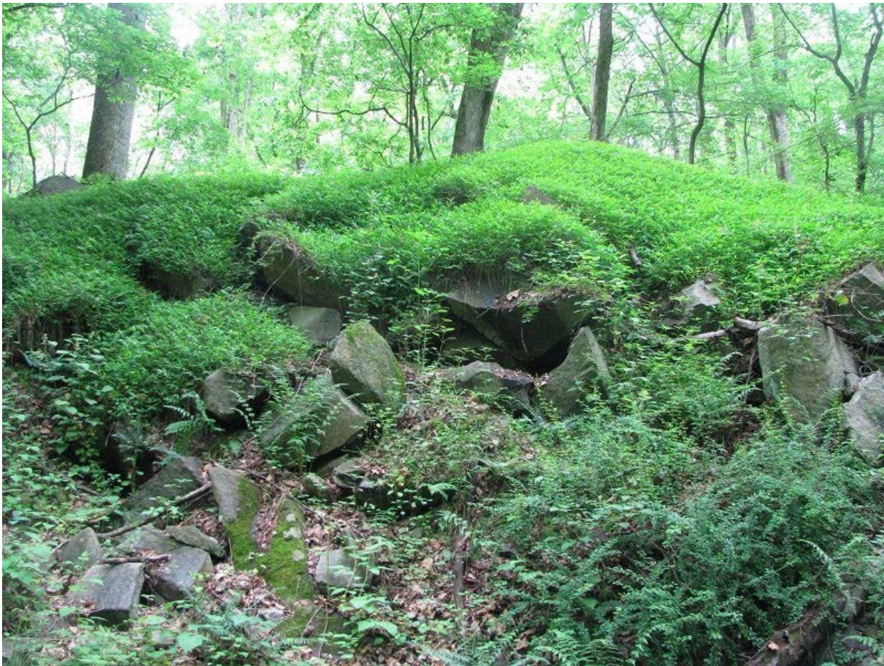
When Wavyleaf Basket Grass Takes Over

We plan to work on this with PRISM (see below).