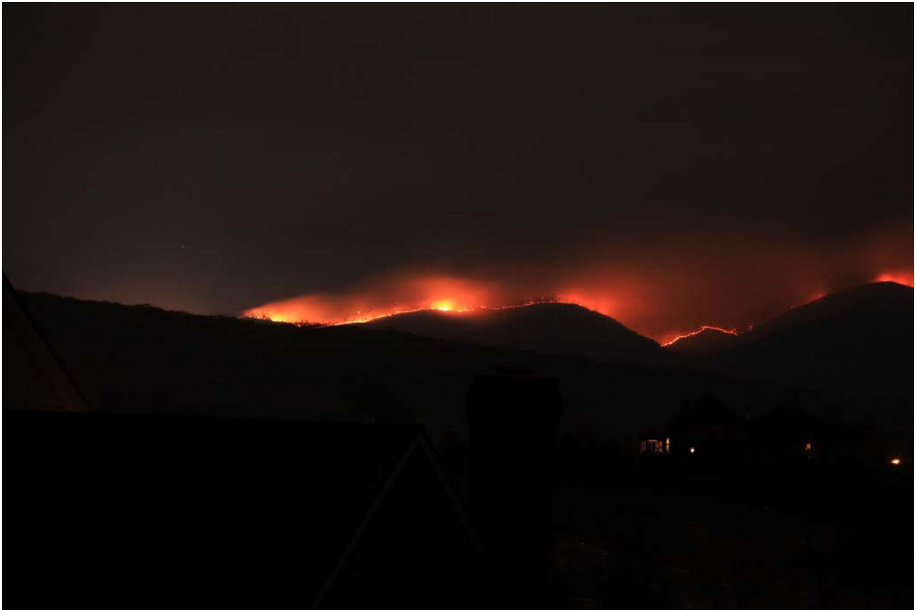
Taken on Cadet Court, east of Harrisonburg.