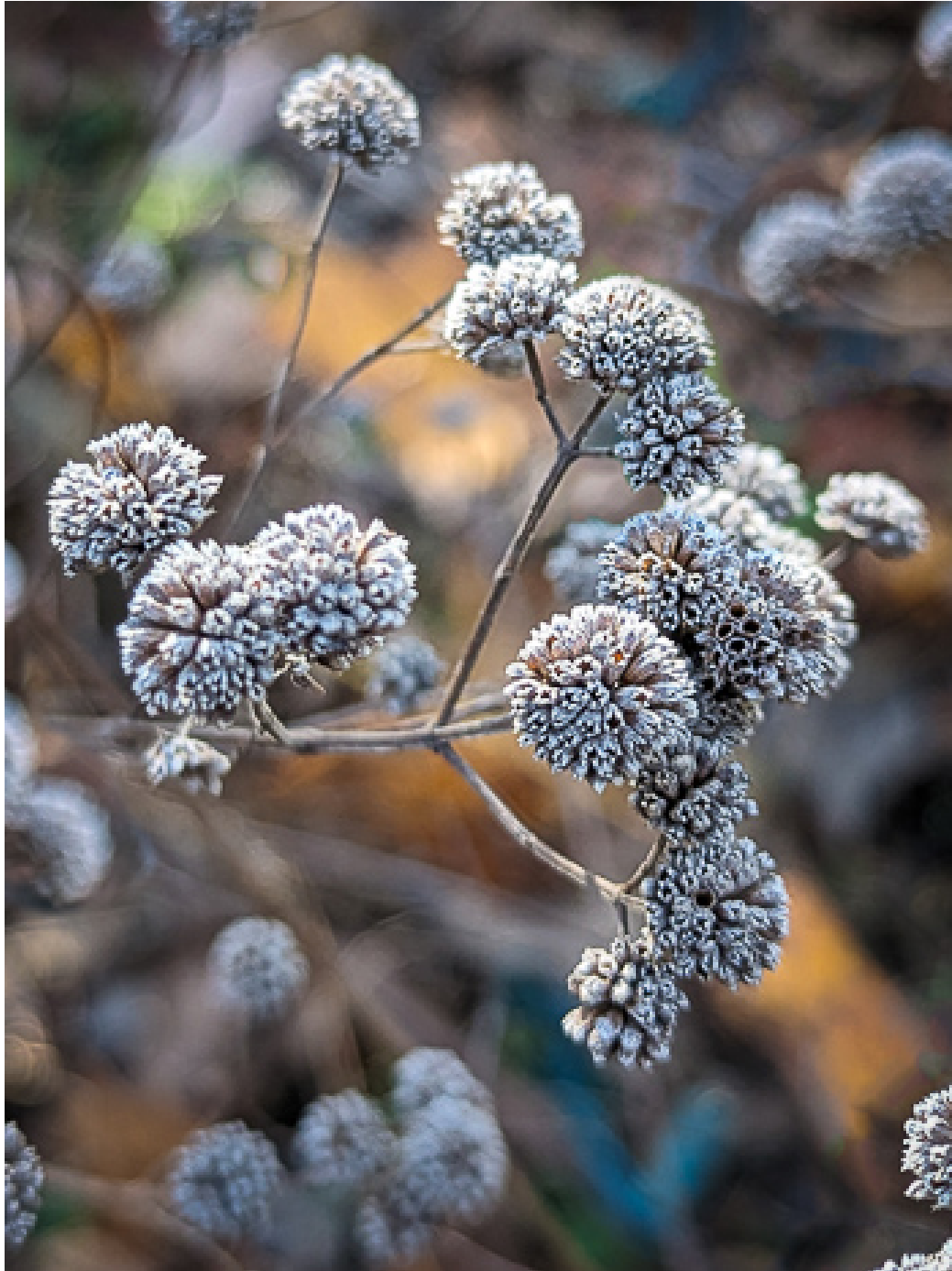
Pycnanthemum tenuifolium (narrowleaf mountainmint)

It's easy to love a garden in spring. The emerging growth and bursting buds are like walking into a fully stocked pastry shop—the treats are everywhere. It takes a different approach to appreciate a place's charms in dormancy.