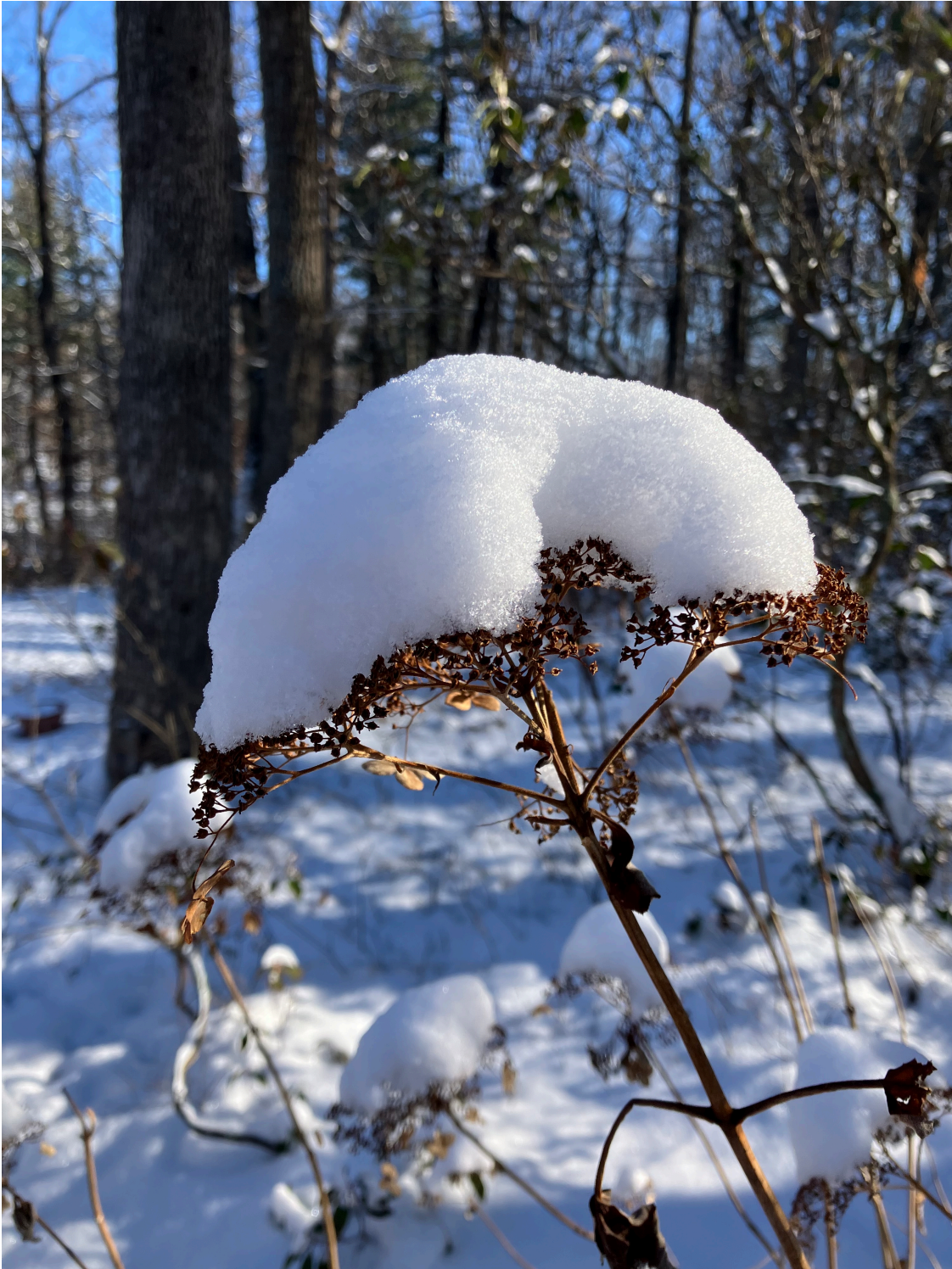
Hydrangea arborescens .