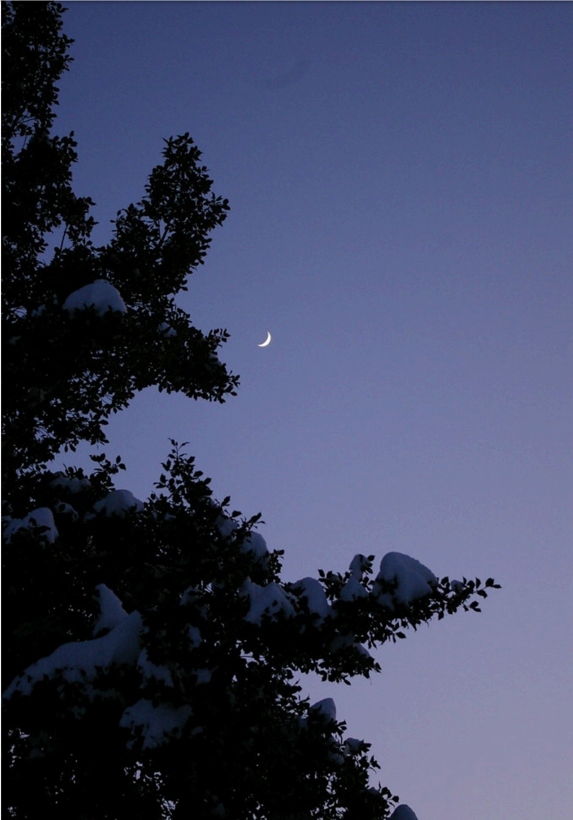
American Holly ( Ilex opaca ), with snow and crescent moon.