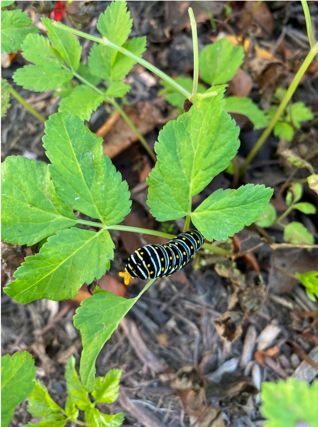
Eastern black swallowtail caterpillar ( Papilio polyxenes asterius ) with osmeterium out. On invasive Bishop's Weed ( Aegopodium podagraria ).