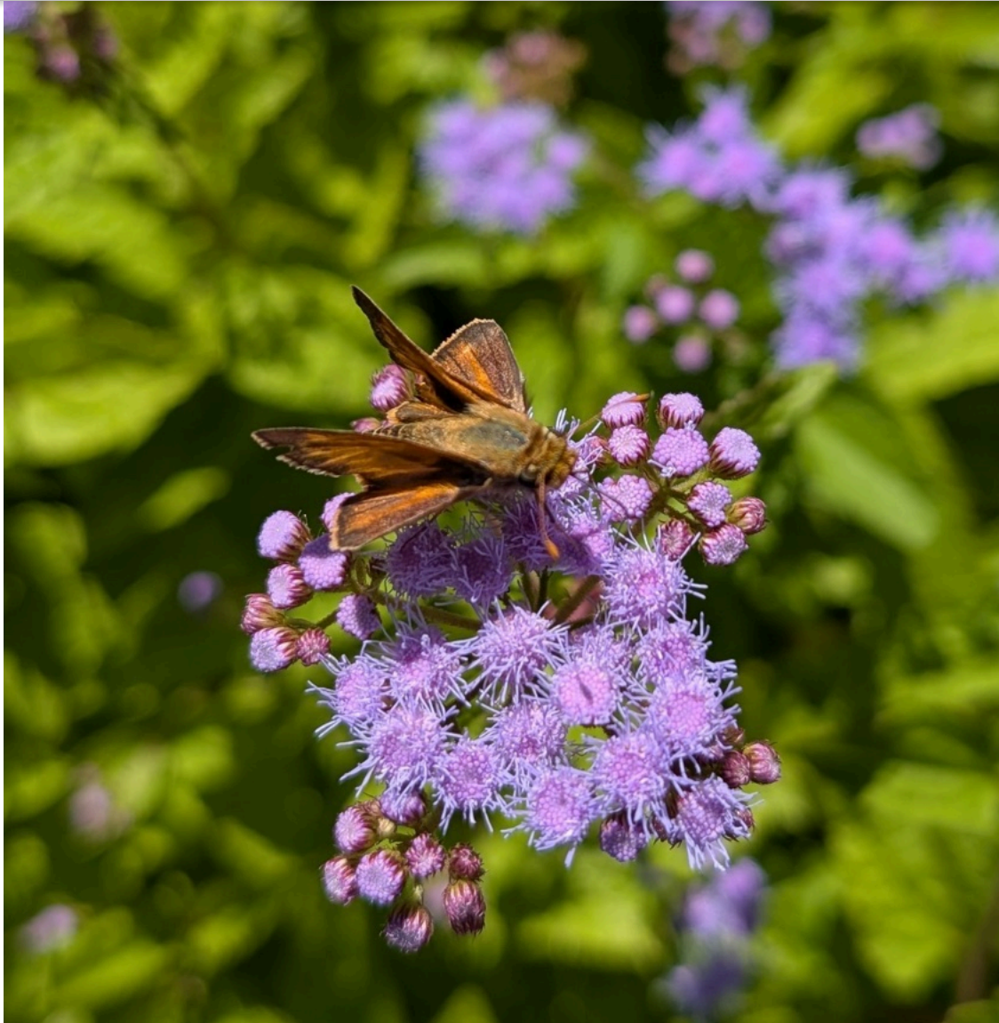
Physostegia virginiana (obedient plant) and Conoclinium fistulosum (blue mistflower) with skipper by Leah Laszewski.

*Send your native plant photos for possible inclusion in future newsletters to shenandoahchapter@gmail.com