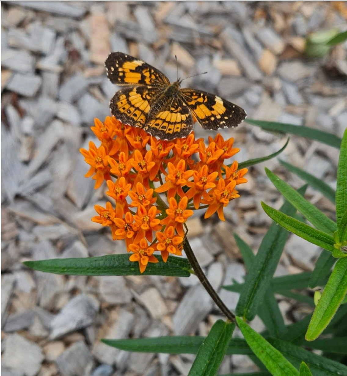
Silvery checkerspot butterfly on Asclepias tuberosa (butterfly weed) by Karen Milne.

*Send your native plant photos for possible inclusion in future newsletters to shenandoahchapter@gmail.com