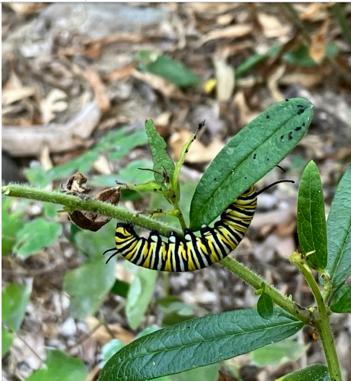
Monarch caterpillar on milkweed.