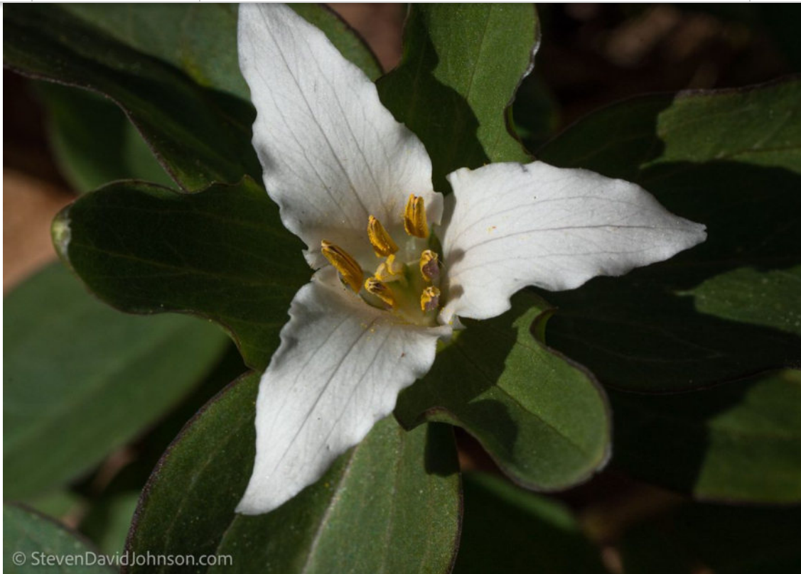
Trillium pusillum var. virginianum located on Shenandoah Mountain