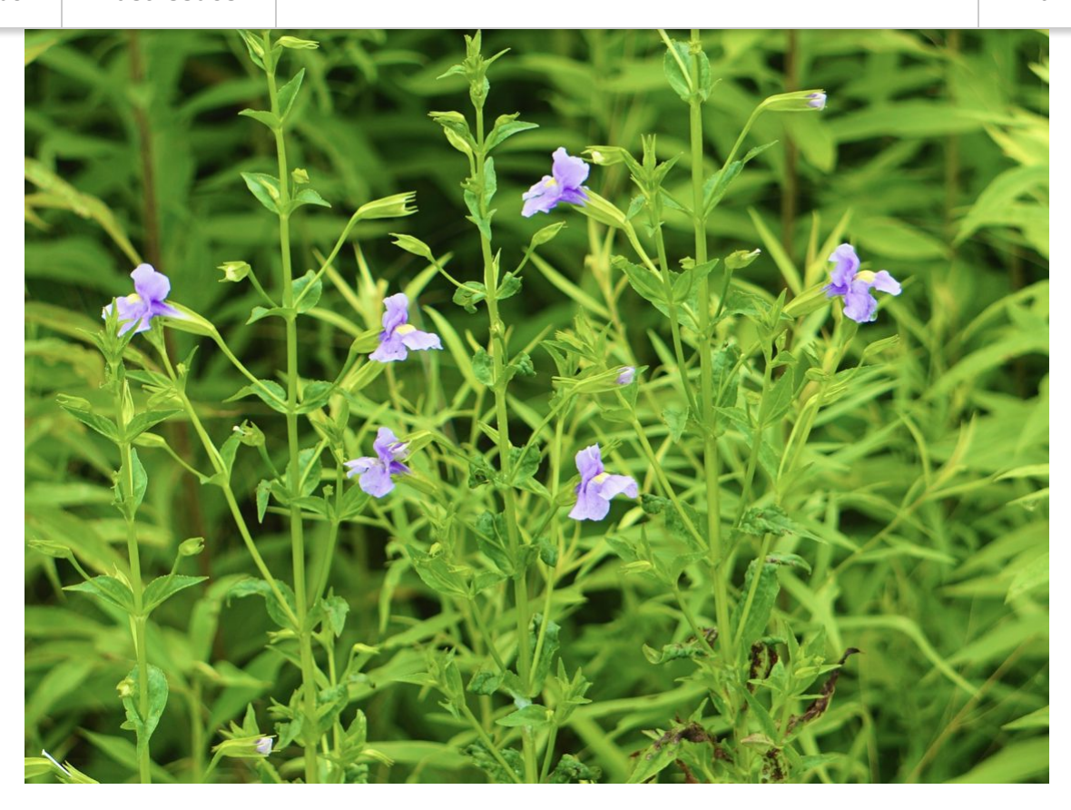
Allegheny Monkeyflower ( Mimulus ringens ), seen at Cowbane Prairie on July 10, 2023, photo by Rae Kasdan.