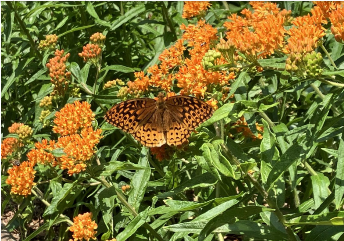
Great Spangled Fritillary with Asclepias tuberosa (Butterfly Milkweed), photo by Barbara Brothers