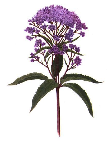
Joe-Lye Weed - Eupatorium purpureum

dispersed. Blooming times are July to October. Most species are found in moist to wet habitats, except for E. purporeum, which is found in drier habitats and even forests.