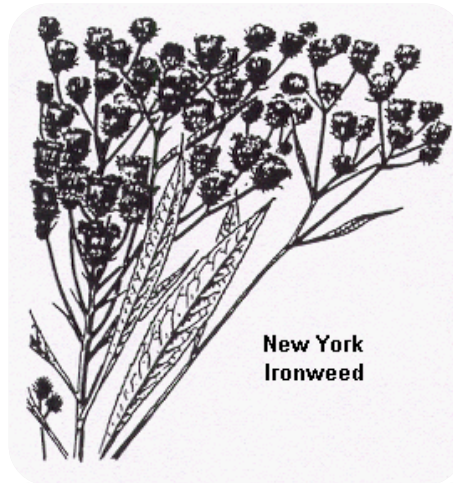
New York Ironweed

Most of approximately 20 species of Vernonia or ironweeds are native to North America out of roughly 500 species worldwide. Referencing the Flora of Virginia , there appears to be significant taxonomic changes to three species: Vernonia noveboracensis (New York ironweed), V. glauca (upland ironweed), and V. gigantea (tall ironweed). Exploration of the taxonomic history of the species and genus reveals a number of earlier taxonomic changes. Linnaeus assigned the genus Serratula noveboracensis to V. noveboracensis , S. glauca to V. glauca , and perhaps S. altissima for V. gigantea in his 1753 Species Plantarum . John Clayton and