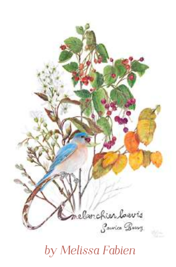
Next Meeting: Thursday, March 7, 2024 Bethel Evangelical Lutheran Church, Plantation Lane, Manassas "Eastern Bluebirds: Getting Them Started, Helping Them Stay"

A Chapter of the Virginia Native Plant Society P.O. Box 83, Manassas, Virginia 20108-0083