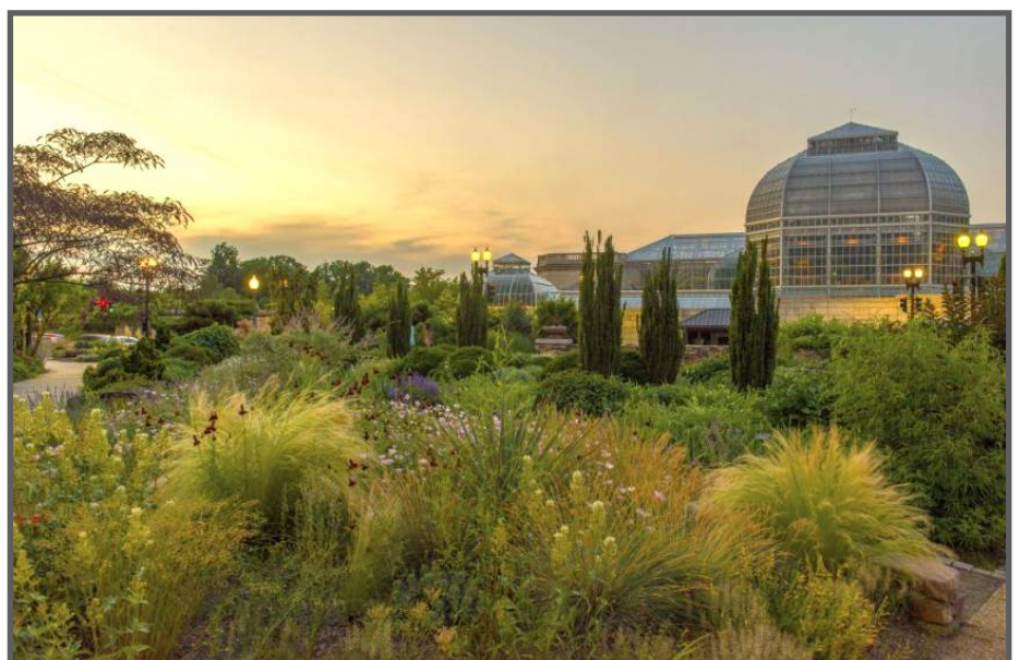
Bartholdi Park