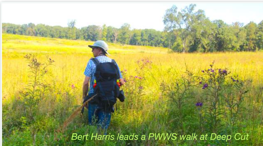
Bert Harris leads a PWWS walk at Deep Cut