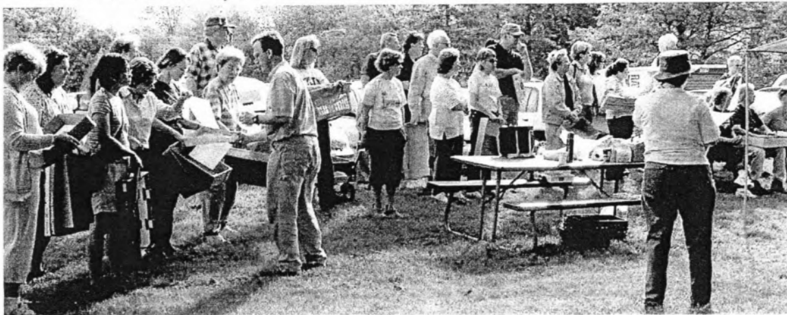
One to Get Ready...PWWS Plant Sale Customers Line Up for the 9:00 Opening