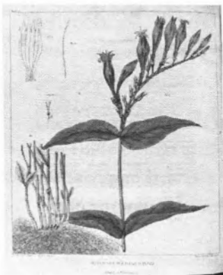
Spigelia marilandica : Carolina pink-root

has become very popular. The reasons for their popularity may be many and vary from one gardener to another. When using