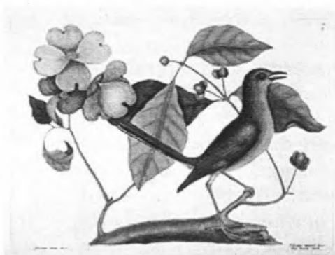
Mark Catesby, Natural History of Carolina, Florida, and the Bahamas . London 1731-43.

The Louer garden in Haymarket features a veritable color-riot of thousands of azaleas connected via grass pathways to woodland beds featuring spring ephemerals such as bloodroot, trillium, and violets. A large marshy area occupies the back of the property, where wooden bridges cross a small stream planted with moisture-loving species such as ferns, cardinal flower and jacks-in-the-pulpit. This garden will be open only for the later part of the day – from 2:00 to an extended 6:00, so folks should plan to tour it last.