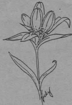
Closed' Gentian ( Gentiana clausa )