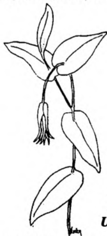
Bellwort Uvularia perfoliata

PRINCE WILLIAM WILDFLOWER SOCIETY A Chapter of the Virginia Native Plant Society PO Box 83, Manassas, VA 22110