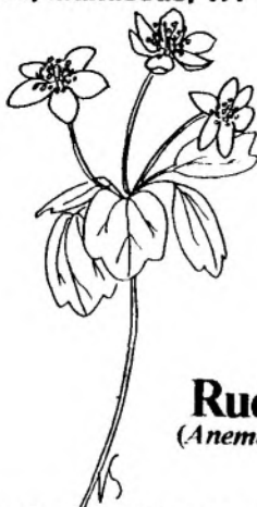
Rue Anemone ( Anemonella thalictroides )

PRINCE WILLIAM WILDFLOWER SOCIETY A Chapter of the Virginia Native Plant Society PO Box 83, Manassas, VA 22110