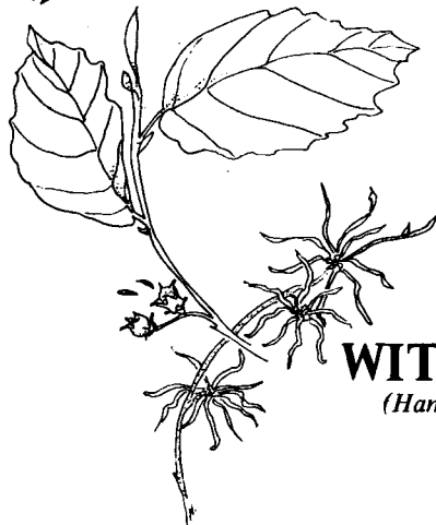
WITCH-HAZEL ( Hamamelis virginiana )

PRINCE WILLIAM WILDFLOWER SOCIETY A CHAPTER OF THE Virginia Wildflower Preservation Society P. O. BOX 462, MANASSAS, VA 22110