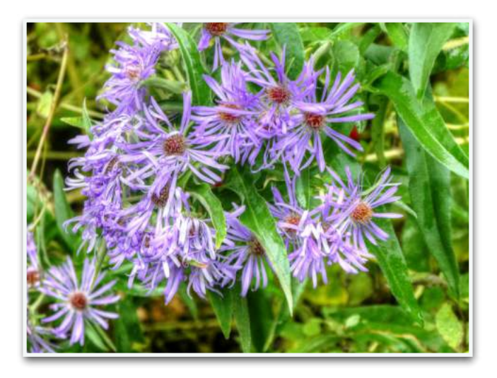
Pictured: New England Aster, Symphyotrichum novae-angliae

In modern taxonomic treatments, the genus Aster has been radically altered for our native "Asters". Based on molecular (DNA) and morphological (physical characteristics) evidence, our area's native "Asters" have been reassigned to five other genera— Doellingeria, Eurybia, Ionactis, Oclemena, and Symphyotrichum. Our only remaining Aster species is the Tartarian Aster, Aster tataricus, an introduced species from Asia. That species and many other Eurasian Asters are primarily still classified in the genus Aster. According to molecular DNA studies, our native Asters are more closely related to Solidago (Goldenrods) and Erigeron (Daisy Fleabanes) species than the Eurasian Asters.