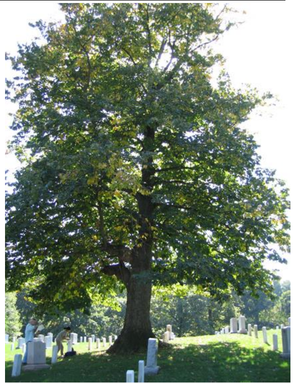
Arlington County Champion Tilia americana at Arlington Cemetery

American basswood is also an excellent street tree and shade tree, because of its very dense shade. It is much more statuesque than the European linden. And it tolerates a variety of site conditions—although it prefers deep rich soils.