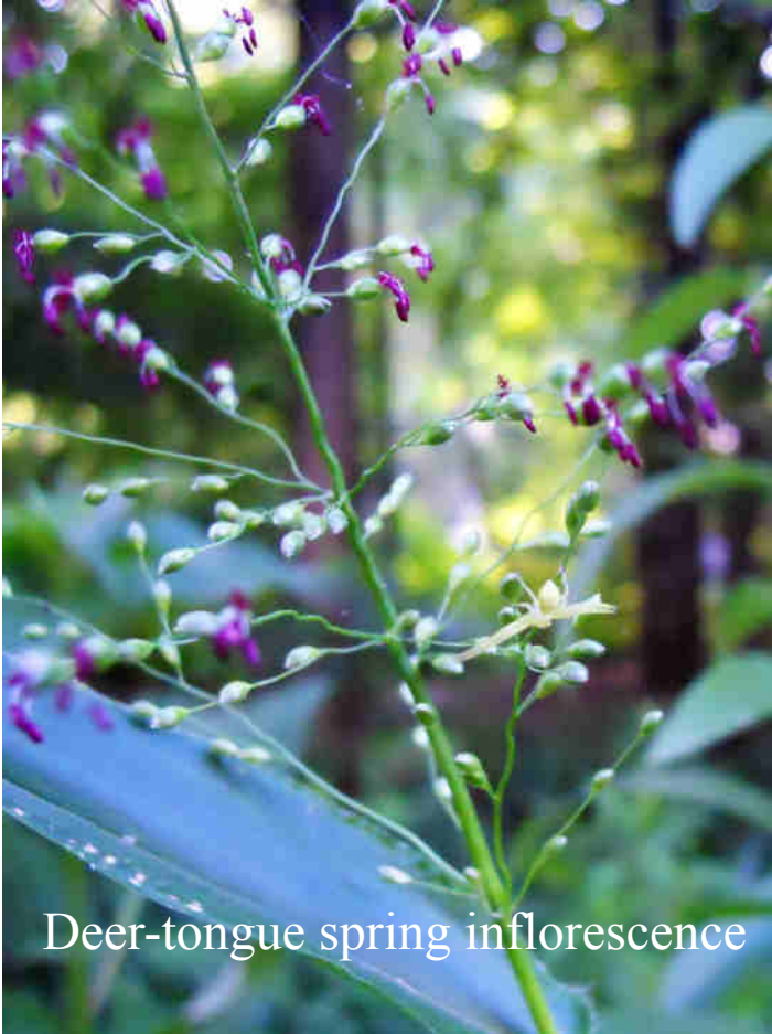
Deer-tongue spring inflorescence

Plants that bear non-opening cleistogamous flowers also bear chasmogamous flowers, which are the showy ones that attract and are pollinated by, well, pollinators. The word “cleistogamy” comes from the Greek kleistos, meaning closed, and gamos, meaning marriage, union or fertilization. “Chasmogamy” comes from the Greek khasma or chasma, meaning chasm or opening; thus, open marriage or fertilization. Bearing both kinds of flowers is one of the many redundancies in the natural world, which in this case enables the plant to propagate even if it is not fertilized by pollinators in the spring.