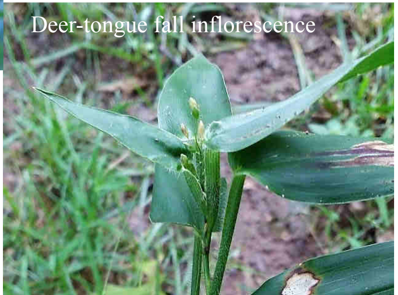
Deer-tongue fall inflorescence

Fast forward to one day last summer, working with Margaret Chatham and Alan Ford at the VNPS propagation beds at Green Spring Gardens. We were looking at deer-tongue grass with its early summer inflorescence. As a casual member of the Grass Bunch, I had learned that a grass’s inflorescence often resembles a seed head, but you may be mistaking florets or spikelets for the seed.