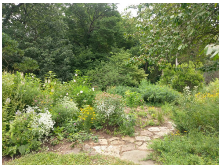
Looking into the replanted area of the top of the Virginia Native Plant Garden almost two months after the Amsonia tabernaemontana was removed.

beautiful native plants throughout my time at Green Spring! I helped label plants with metal photo labels as well, which was useful in learning plant names.