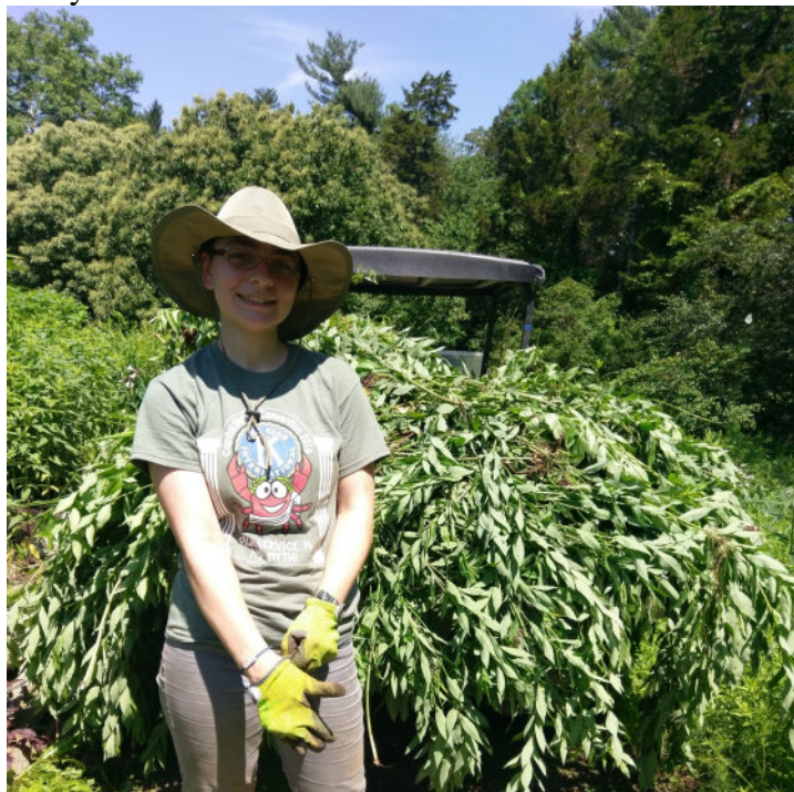
This is me with a cart full of the Amsonia tabernaemontana (and a few other things) removed from the top of the Virginia Native Plant Garden.

Some natives thrive in well-watered gardens! On one of my first days as an intern, I spent several hours removing a large patch of native Eastern Blue-star ( Amsonia tabernaemontana ) from the sunny border by the stone path at the top of the native plant garden where it had reseeded too freely. It was rewarding to be able to plant new things in the newly cleared area and elsewhere in the gardens. It was exciting to discover so many