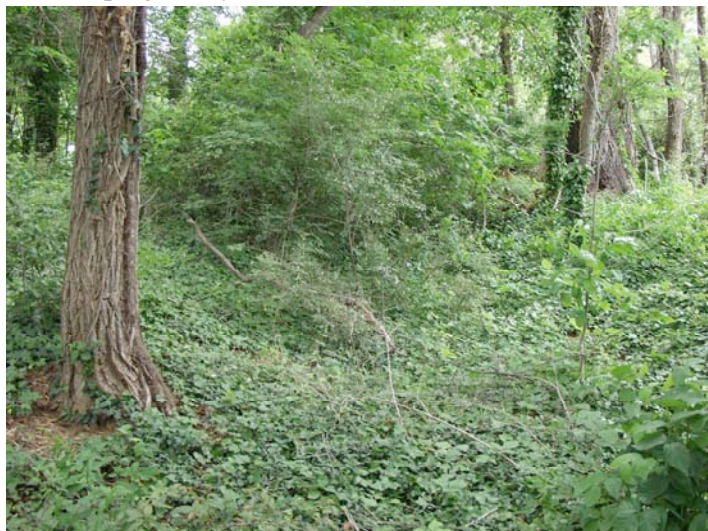
ENGLISH IVY, *HEDERA HELIX, BEFORE AND AFTER A VOLUNTEER CREW'S WORK

MARIE BUTLER LEVEN PRESERVE CONT'D FROM PAGE 1 Fairfax County Park Authority support to spray advancing carpets of Japanese pachysandra, *Pachysandra terminalis , and creeping euonymus, *Euonymus fortunei .