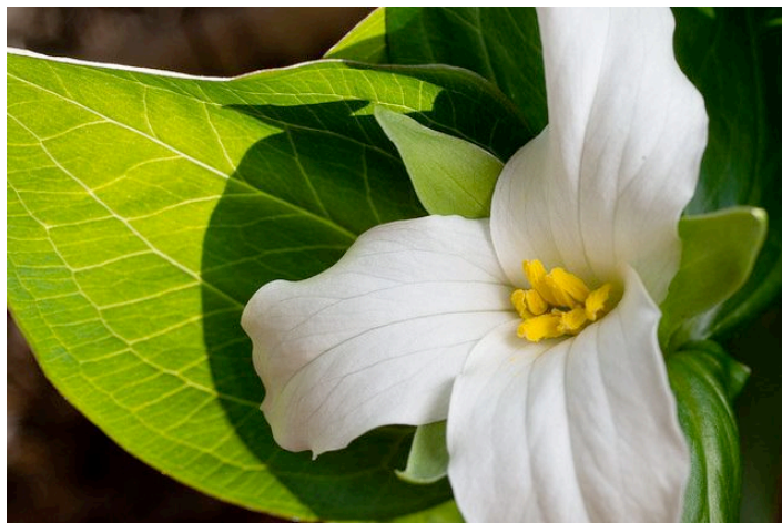
TRILLIUM GRANDIFLORUM ABOVE, DICENTRA CANADENSIS BELOW, PHOTOS BY MATT BRIGHT

That's not to say it's all bad news! When I led a tour of the preserve this spring for the Potowmack Chapter, I focused on the wooded valley in the center of the park. This area boasts an impressive array of trillium, probably second only to Meadowlark's own collection. At least four species are present, large-flowered trillium, Trillium grandiflorum , wake-robin, T. erectum , toadshade trillium, T. sessile and yellow toadshade trillium, T. luteum . A quick check of the Flora of Virginia suggests that none of these are genuinely native to this park. Instead, it is far more likely that these species, native elsewhere in Virginia, are a part of the botanical history of the preserve and may well have been planted by the Leven family before they bequeathed it to the Park Authority.