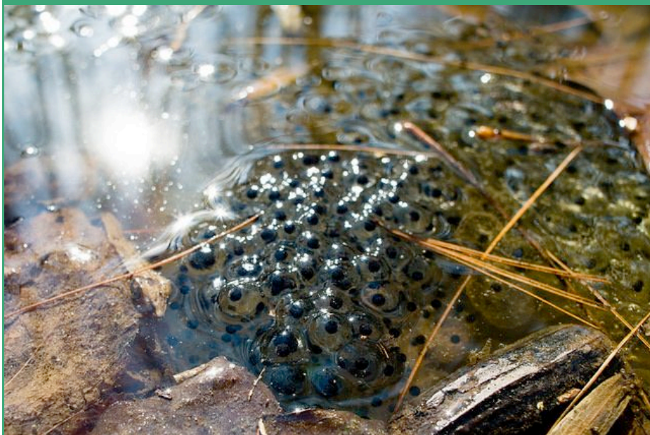
FROG EGGS IN VERNAL POOL AT MARIE BUTLER LEVEN PRESERVE MARCH 9, 2016.