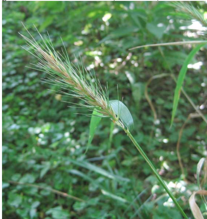
ELYMUS VIRGINICUS, VIRGINIA WILD RYE, GROWS SUBSTANTIAL AWNS.

In looking at grass flowers, one speaks of glumes, palea and lemma (the bracts that grow around the grass flower and later the seed) and awns (thin bristles