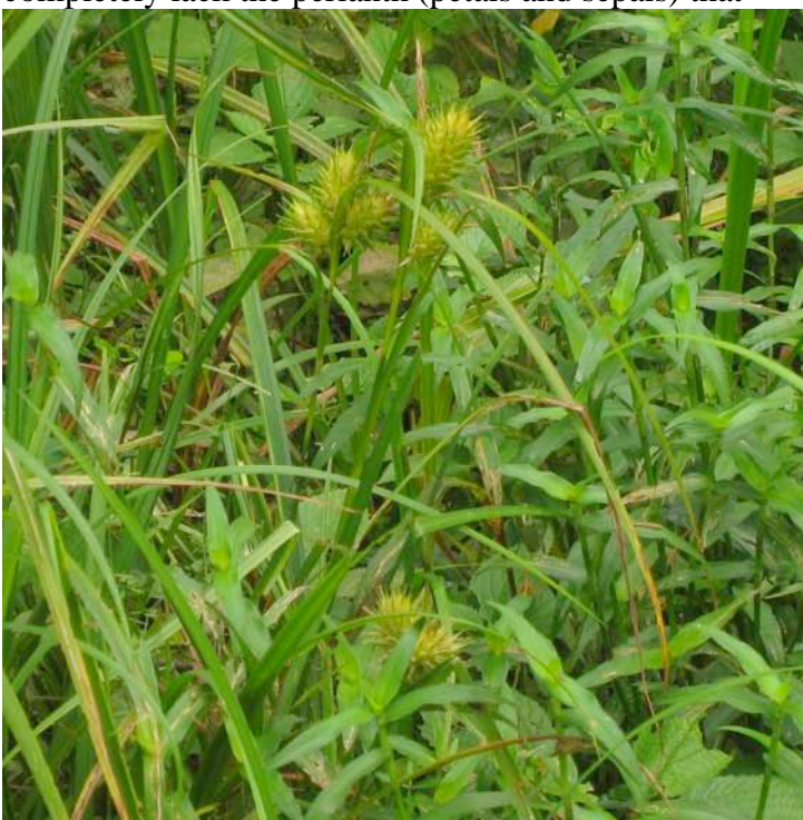
THREE-SIDED CAREX LUPULINA GROWS ABOVE TWO-RANKED ARTHRAXON HISPIDUS (NON-NATIVE GRASS) we think of when we picture a flower, but the essential stamens and pistils are there. It's producing and spreading enough pollen to make wind-pollination work that causes hay fever.

The genus and species of a grass (or sedge) plant will be determined by the size and placement of the several parts of the plant, e.g., leaves, stems, branches, flowers, and seeds. In general, grasses grow their leaves alternately on opposite sides of the stalk producing a "two-ranked" arrangement, while sedges grow their leaves in three directions, sometimes around a triangular culm. While grass leaves may be flat, sedge leaves often form a V or even a W shape in cross section. Sometimes, the several parts of the flowers must be examined to be certain about its species. Flowers, you say? You bet – these are flowering plants that can produce the grains just mentioned. As wind-pollinated flowers, they almost