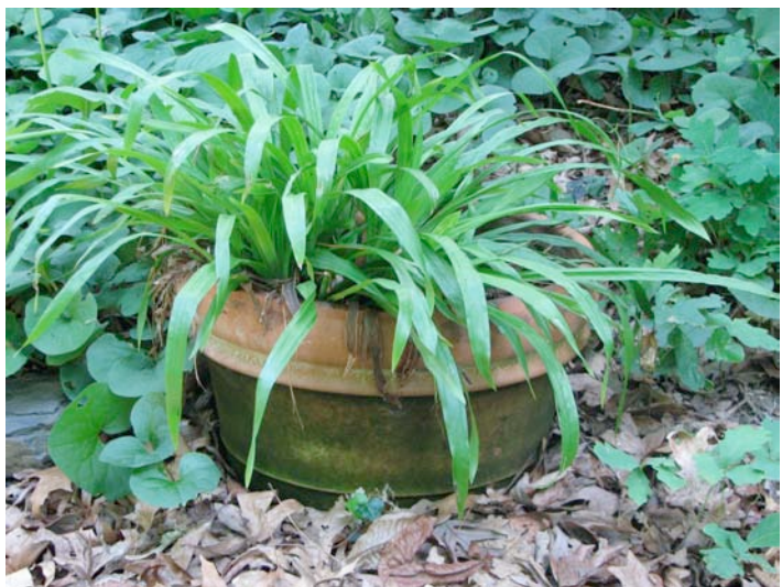
CAREX PLANTAGINEA IN A WELL-DRAINED POT.

Native sedges are hardy; some are even evergreen. They are plentiful except where there's been extensive ground disturbance. Most sedges have a clumping growth habit, also described by the Flora of Virginia as "growing in dense tufts," while others have a more spreading nature. Both growth patterns are achieved by the underground internodes of rhizomes supporting plant expansion. In fact, new plants in relation to the parent are dependent on the spacing of those internodes. The result is the almost uniform spaces of some of the species.