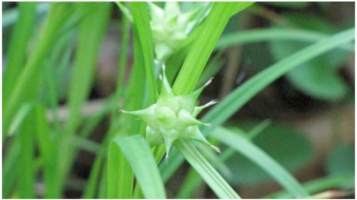
CAREX GRAYI'S MACE-LIKE PISTILLATE SPIKE

maces. Like other sedges, their seed heads are a food source for songbirds and water fowl. This plant does require more moisture and can often be spotted along stream banks.