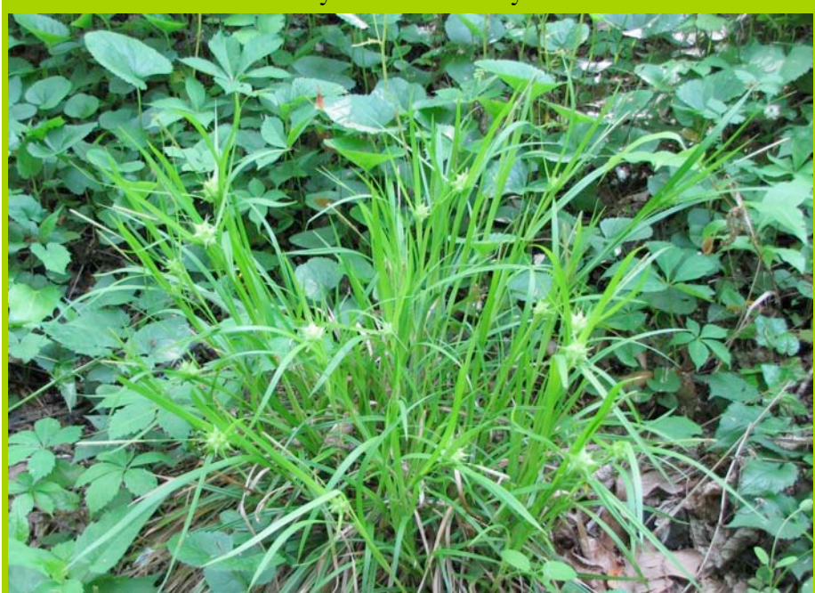
CAREX GRAYI.

Native sedges or Carex species are growing in popularity, even sometimes replacing turfgrass lawns. A December, 2001, article from the Brooklyn Botanic Garden states: "Few breakthroughs in the history of turf have been as significant as the arrival of an entirely new kind of lawn--the sedge lawn." Current landscaping books and publications encourage homeowners to incorporate native grasses and sedges into their landscapes for their many wildlife benefits.