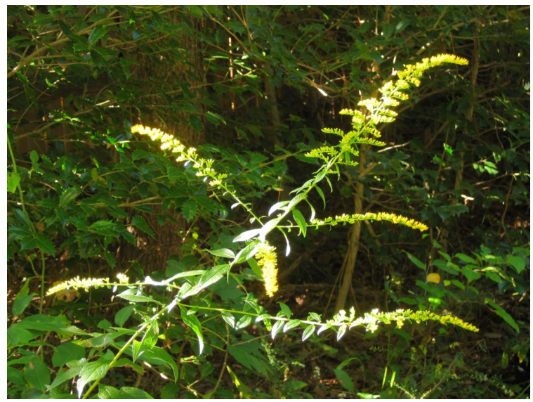
Elm-leaf Goldenrod, Solidago ulmifolius

For woody plants and herbaceous perennials, fall is the best time to plant. In the spring, plants are busy growing leaves and flowers, but in the fall, they concentrate on growing roots. Take advantage of their root growth season to get your new treasures well settled and ready for many years of enjoyment.