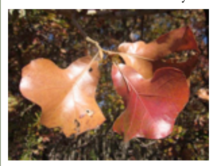
Rounded-lobed form of Blackjack Oak leaves on tree at high gravel terrace at. Turkeycock Run Stream. Valley Park in Annandale, VA.

Bush's Oak ( Quercus x bushii ) - a fairly common natural hybrid between Blackjack Oak and the much larger Black Oak ( Quercus velutina ) - is perhaps more commonly seen today than pure Blackjack Oak. The hybrid has foliage similar to Blackjack Oak (though larger-leaved and less rounded), but is usually a much larger tree. (The City champion Bush's Oak grows in an old section of woodland at Stevenson Park.) Many champion-sized Blackjack Oaks on Big Tree lists are probably the hybrid. Black Oak and Southern Red Oak ( Quercus falcata ) saplings and young trees also often have foliage that resemble Blackjack Oak. (See " Native Vascular Flora of the City of Alexandria, Virginia " at the above site for more on native oaks and their natural hybrids in the City of Alexandria.) A database of these and other notable trees in Alexandria is maintained by the City Arborist Office.