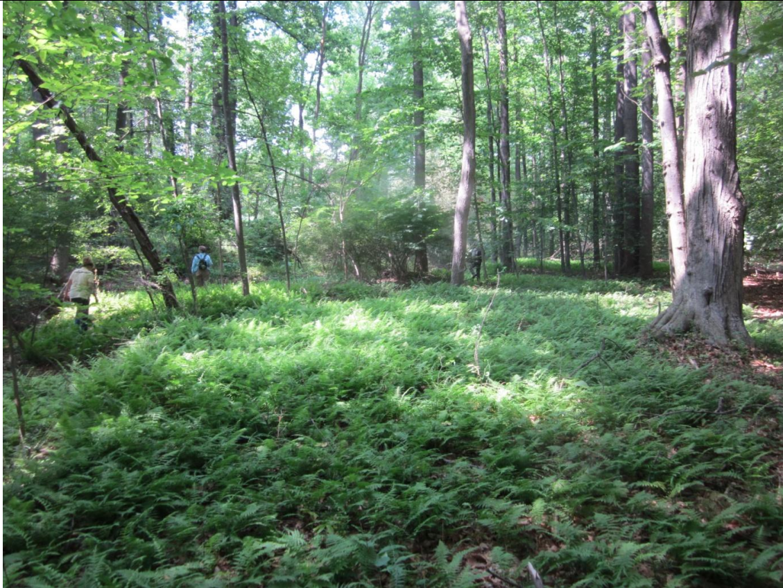
Fig. 2. Large New York Fern ( Thelypteris noveboracensis ) glade in Coastal Plain / Piedmont Small Stream Forest along the east branch of Turkeycock Run, Fairfax County, Virginia.

Fosberg's Magnolia Bog remains, but is almost irreparably degraded – the result of channelized stormwater runoff from neighboring Orleans Village Apartments and subsequent tree blowdowns, soil disturbance, and infestations of invasive exotic plants. However, the stream valley becomes much less disturbed northward towards Lincolnia Road and a small, mostly pristine Magnolia Bog and Acidic Seepage Swamp complex was discovered upstream. (The Magnolia Bogs and woodland seeps typically occur along the toe-slopes of hillsides where springs emerge from the sand and gravels and thick impermeable clays of the Potomac Formation.)