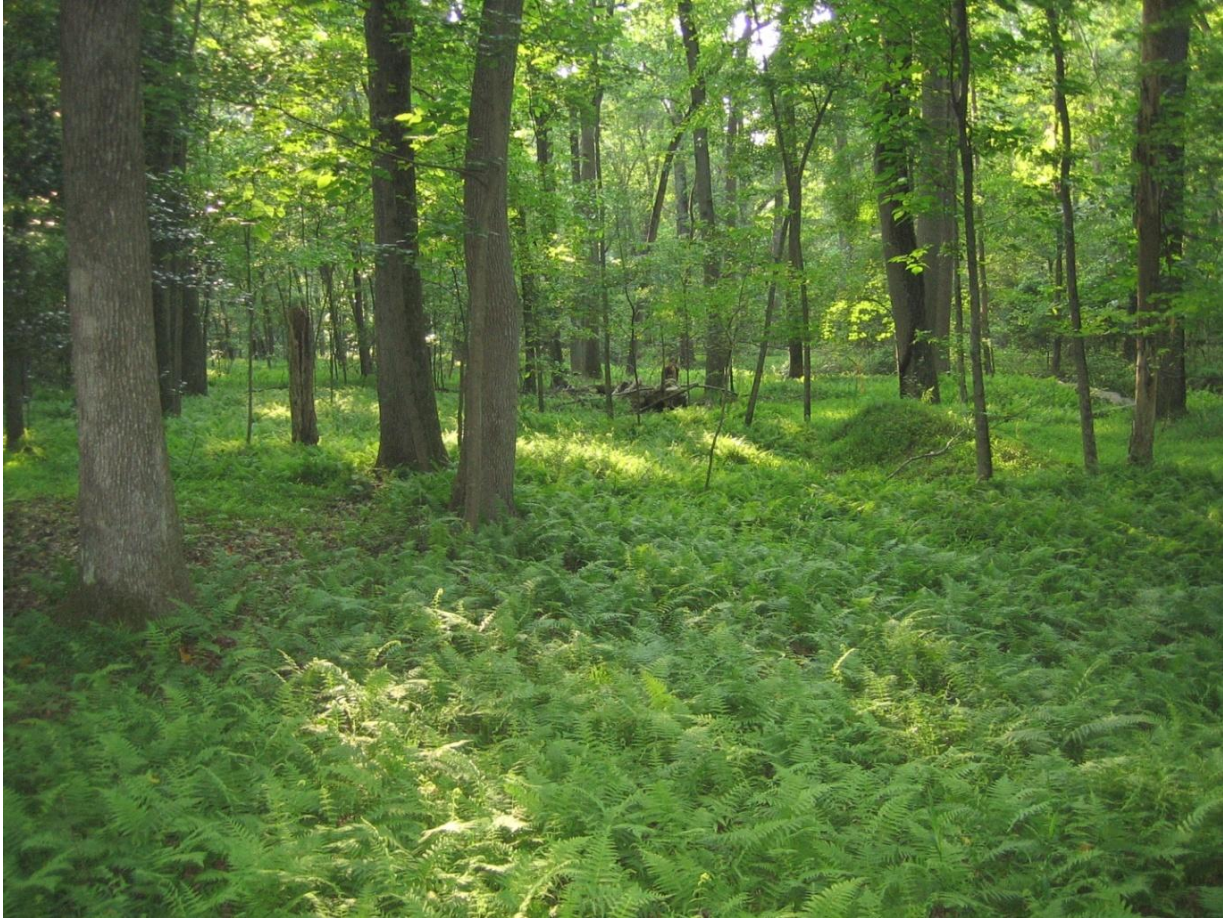
Fig. 1. Extensive colonies of New York Fern ( Thelypteris noveboracensis) along Still Creek at Greenbelt Park, Prince George's County, Maryland.