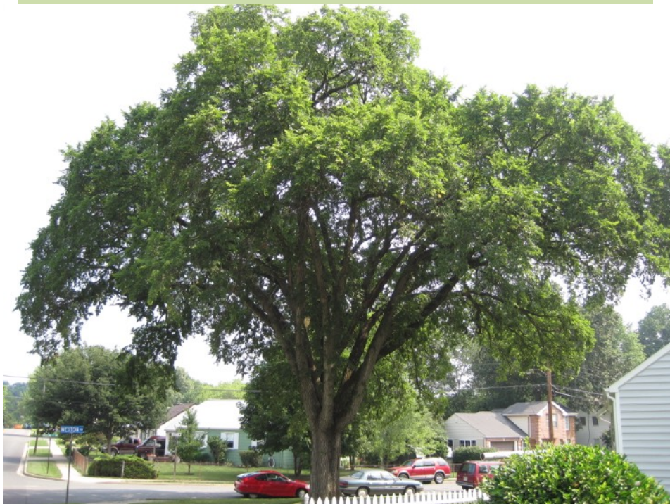
AMERICAN ELM. ULMUS AMERICANA .

To misquote Mark Twain, “The reports of American elm’s extinction are greatly exaggerated.” It is true that Dutch elm disease has wiped out the towering leafy arches that graced many an Elm Street, but some big old trees persist where they have room for their roots, and especially along forested streams or rivers, and younger, smaller trees grow in many woods and roadsides. Their tiny apetalous flowers open and quickly start growing seeds before their leaves open. These early flowers make elms stand out against the bare branches of other trees in February or March.