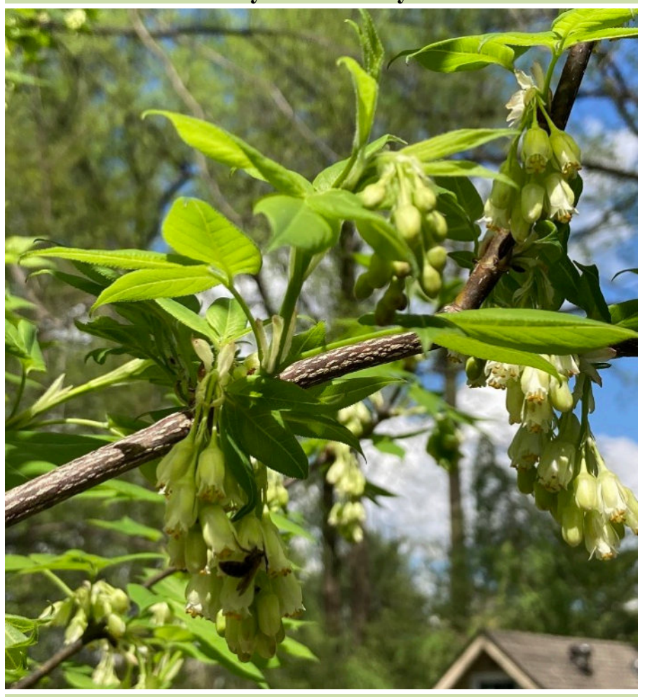
AMERICAN BLADDERNUT IN FLOWER.

The American Bladdernut tree has a scientific name with a rhythmical quality: Staphylea trifolia , staf-i-LEE-a try-FOH-lee-a. This small, suckering tree or large shrub is found in almost every county in Virginia; in fact, it grows in most of the East Coast, from Southern Ontario into Florida, and well into the Midwest.