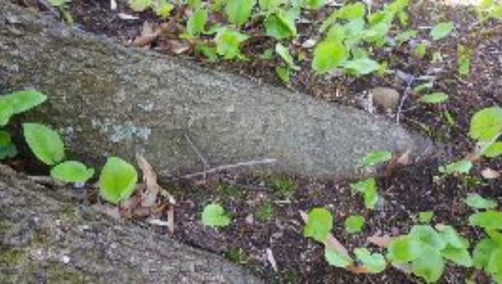
QUERCUS FALCATA ROOTS AMONG MAIANTHEMUM CANADENSE.