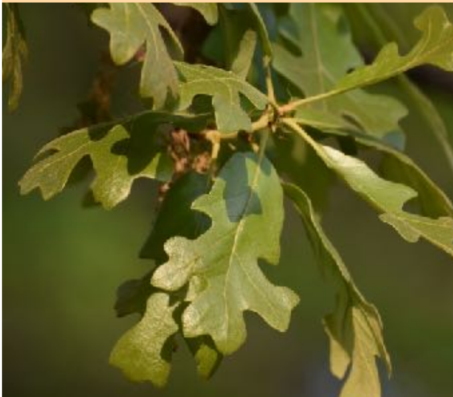
POST OAK ( QUERCUS STELLATA ) CRUCIFORM LEAVES.

A stunted tree growing on a ridge overlooking New Haven, a set of gnarled branches emerging from rock outcrops along Long Island Sound; these were my first experiences with Post Oak ( Quercus stellata ) in Connecticut where the species occurs in only the driest conditions near the coast.