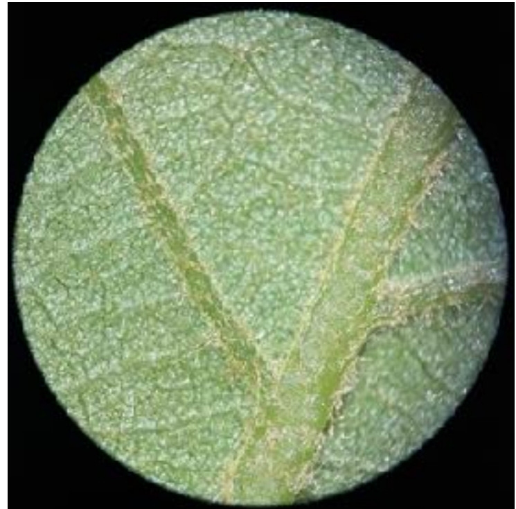
LEFT: A RARE CANOPY POST OAK; ABOVE: STELLATE HAIRS ON POST OAK LEAF UNDERSIDE.

Post Oak also develops distinctive cruciform leaves that are often compared to a Maltese Cross, though in my opinion, the shape more closely resembles that of an Orthodox Cross. The leaves are fairly stiff and leathery with 3-7 (though usually 5) lobes. The upper surfaces eventually develop a satin sheen with age, but the undersides remain densely pubescent with a mat of star-like hairs that give Post Oak its species epithet ('stellata' is Latin for 'star'). In Autumn, the leaves mostly turn brown, but many can be imbued with a reddish tint that is accentuated by their subtle sheen.