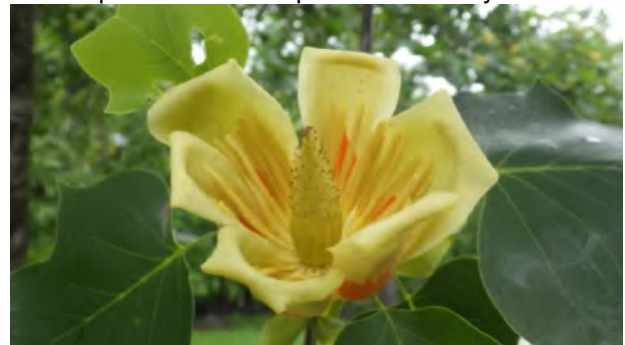
MASSIVE TULIPTREE IN ALDIE, PHOTO BY FRITZ REUTER; BLOSSOM PHOTO BY ROD SIMMONS.

Tuliptree is our tallest and handsomest tree in the East. Though it readily repopulates disturbed sites, it can live 500 years. It is beloved by beekeepers for the prodigious amount of easily accessible nectar it produces, used by all types of bees, beetles, flies and hummingbirds. Tuliptree honey is a dark amber with a bold flavor. Its aromatic leaves host Eastern Tiger Swallowtail, Promethea and Tuliptree Silk Moth caterpillars among 50-odd species. You won’t find this tree on Doug Tallamy’s list of “Best Bets” for attracting large numbers of butterflies and moths due to the limited range of species it hosts; but for sheer numbers of caterpillars it does its part to feed baby birds.