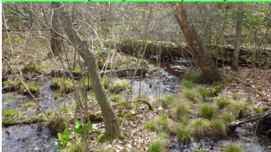
NORTHERN COASTAL PLAIN TERRACE GRAVEL BOG.