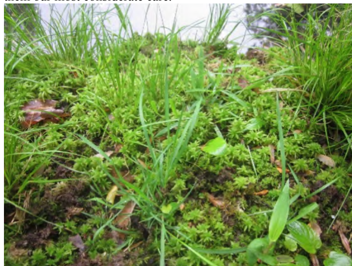
PEAT MOSS ABOVE; SWEETBAY MAGNOLIA IN LEFT COLUMN

W.L. McAtee's words from 1918 as to the irreplaceable preciousness of these small wetlands are even more urgent today: “The antiquity of some of these little waifs and the vicissitudes they have survived entitles them to our respect, while the slender thread upon which their continued existence depends commends them our most considerate care.”