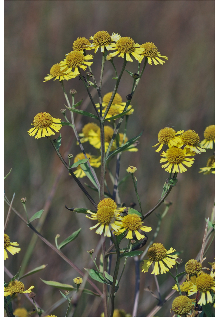
HELENIUM AUTUMNALE, SNEEZEWEED.

Most of these bioactive compounds have been isolated from Asteraceae, also known as Compositae, the largest and most diverse family of flowering plants on earth.