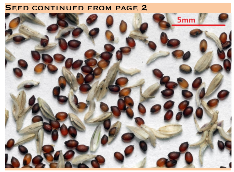
SEED OF ERAGROSTIS SPECTABILIS, PURPLE LOVEGRASS, MAGNIFIED TO SHOW TRANSLUCENCE.

It's not necessary to separate the seed from the chaff, if you're confident there is seed attached to or mixed in with the chaff. But if you are packaging seed to sell, cleaning the seed is a lot more important, plus it's fun to figure out ways to do this. Some seeds are smooth and round and will roll out of the chaff when you tip the container. Some chaff can be blown away, but you risk blowing away some of the seed too. Using a sieve works, but only if the bits of chaff and seed are different enough in size. A good way to separate small seeds from hard capsules is to use a mortar and pestle to gently tap the capsules. Then screen them through the right size sieve, and the bare seeds magically appear. This happens with seed capsules from Hypericum stragulum , Low St. Andrews Cross.