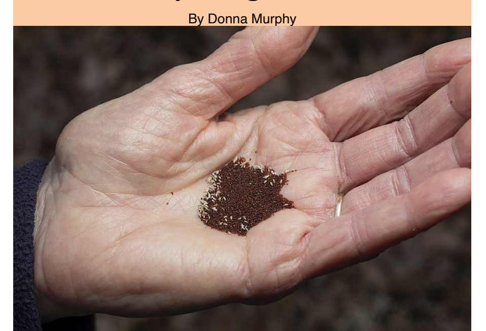
SEED OF ERAGROSTIS SPECTABILIS, PURPLE LOVEGRASS.

I recently separated a variety of seeds, packaged each species in a small envelope and labeled them with the satisfaction of a labor-intensive job completed. I love to study seeds. When I started collecting them for propagation, I didn't expect I would find the characteristics of the seeds themselves so entertaining and interesting.