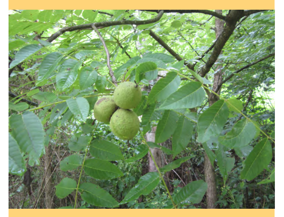
BLACK WALNUT, JUGLANS NIGRA.

A squirrel buried a Black Walnut ( Juglans nigra ) in your yard but never returned to dig it up and eat it. Now it's sprouting. What should you do about it? The answer depends a great deal on exactly where that squirrel put it. Black Walnuts become large trees, and if they have a neighbor to trade pollen with on the wind (as a squirrel-planted walnut generally does), they will eventually be dropping car-denting nuts from 50 or more feet in the air. On the other hand, if you have the space and sun, and all goes well, you could be harvesting those pricey nuts in 10 years.