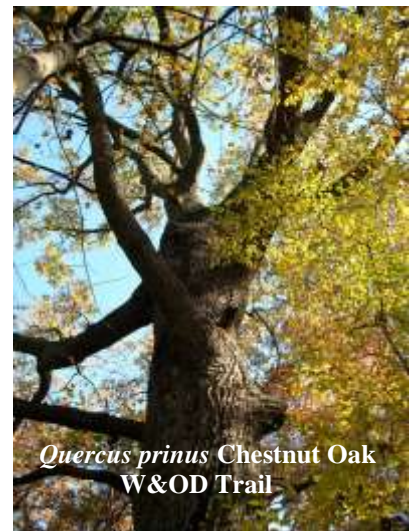
Quercus prinus Chestnut Oak W&OD Trail

Directions to Green Spring Gardens: From Interstate 395, exit at Route 236 West (Little River Turnpike); turn right at Braddock Road and go 1 block north to park entrance.