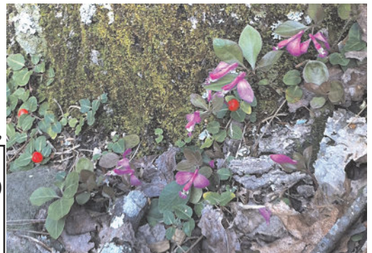
Photo: On left, Partridge Berry ( Mitchella Repens ) and on right, Gaywings ( Polygala paucifolia ).

Unexpectedly cold! That was our first impression. Clearly, it affected the plants, too. Tulip poplars were beginning to leaf out,