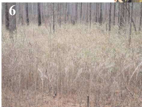
6. Switch cane ( Arundinaria tecta ) growing in a wet area.