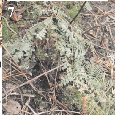
7. Ebony spleenwort ( Asplenium platyneuron )