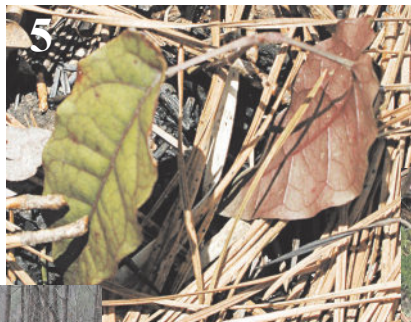
5. Cross vine ( Bignonia capreolata )