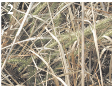
2. A clubmoss.