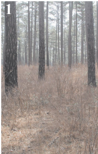
1. View as we walked into the preserve.

http://www.nature.org/ourinitiatives/regions/northamerica/unitedstates/virginia/placesweprotect/piney-grove-preserve.xml