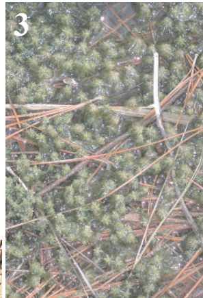
3. Sphagnum Moss ( Sphagnum spp.)