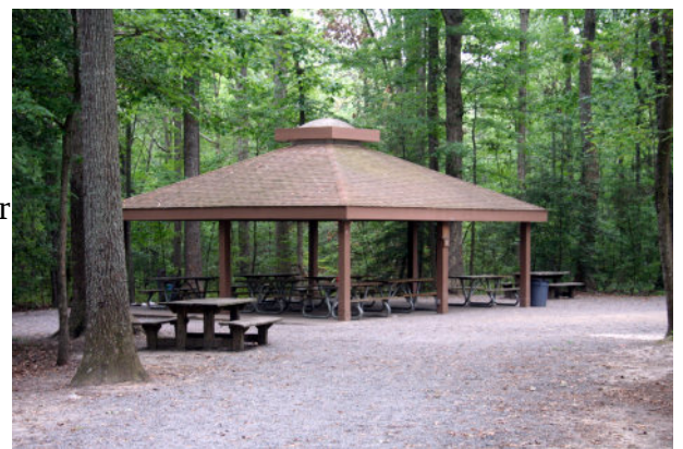
Gazebo at Dorey Park