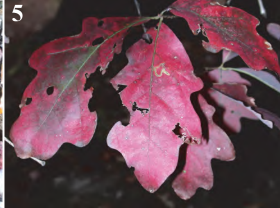
More photos: 1. Dogwood ( Cornus florida ), this one red and yellow 2. Yellow, Pawpaw ( Asimina triloba ) leaves. 3. Buttonbush ( Cephalanthus occidentalis ) in the Richfood swamp. 4. Cranefly orchids ( Tipularia discolor ) leaves appear in October. 5. White oak ( Quercus alba ) leaves. Usually white oaks turn brownish-yellow but this branch turned bright red.

Pocahontas Chapter Virginia Native Plant Society 12565 Brook Lane Chester, VA 23831