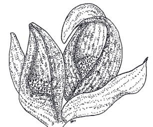
Skunk Cabbage flower