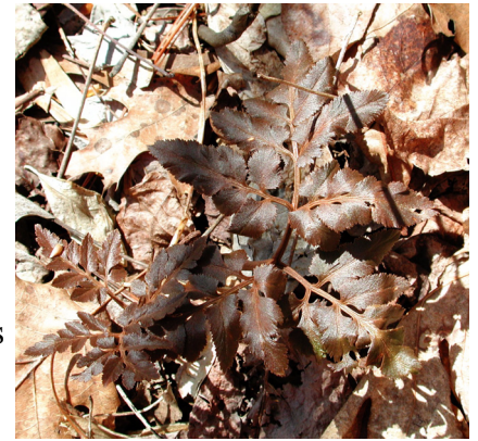
A grape fern ( Botrychium dissectum )

Pocahontas Chapter Virginia Native Plant Society 12565 Brook Lane Chester, VA 23831