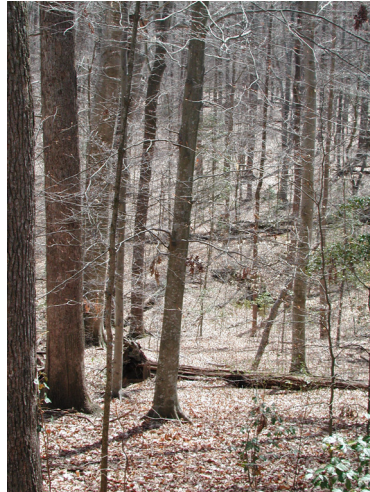
Catharine's woods: An example of a mature hardwood forest. Note the lack of understory plants