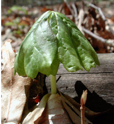
Mayapple ( Podophyllum peltatum )