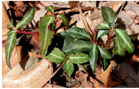
Striped wintergreen ( Chimaphila macula )