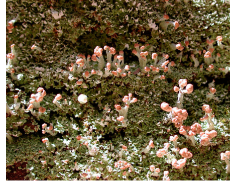
The lichen british soldiers ( Cladonia cristatella )