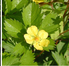
Common cinquefoil ( Potentilla simplex )