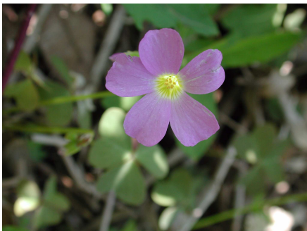
Violet Woodsorrel ( Oxalis violacea )