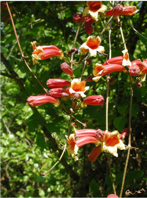
Left: Crossvine ( Bignonia capreolata ) was in flower along the side of the trail leading down to the river.