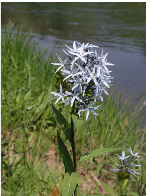
Eastern Bluestar ( Amsonia tabernaemontana ) was found in numerous areas along the trail.