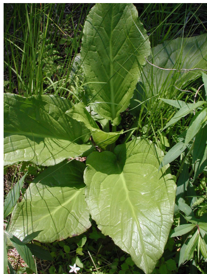
Skunk Cabbage ( Symplocarpus foetidus ) in a swampy area near the trail. The small white flower at the bottom of the picture is a Spring Beauty ( Claytonia virginica )