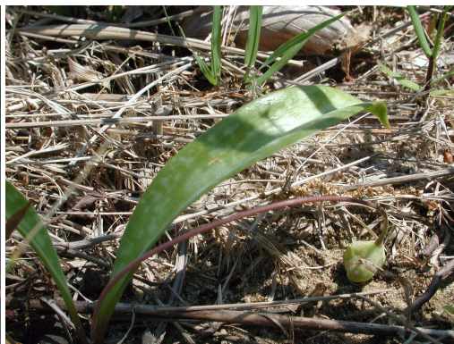
Trout lily ( Erythronium americanum ) with seed pod.