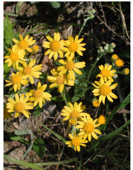
Probably one of the ragworts, ( Packera ?).