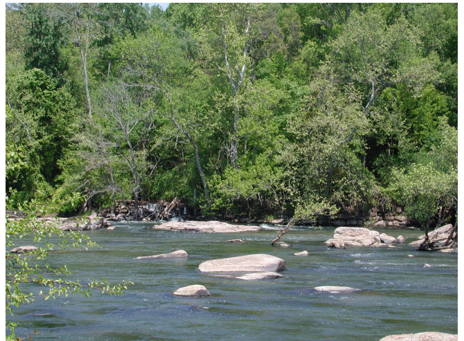
The River - The Rock wall along the far bank is a part of the Appomattox River Canal.