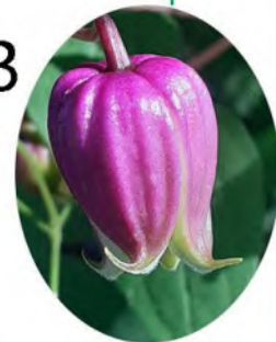
Leatherflower ( Clematis viorna )

For more information: goingnativerichmond@gmail.com