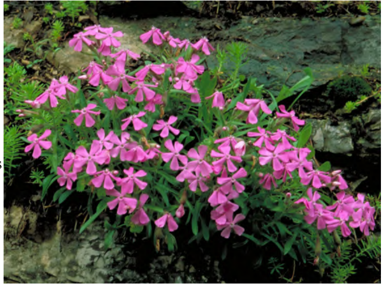
Silene caroliniana Flowers

This showy, semi-evergreen perennial is native to much of the central and eastern United States however the subspecies most commonly found in Virginia is Silene caroliniana var. pennsylvanica . It prefers dry, sandy and well draining soil and full sun to part shade conditions. Although it will tolerate moist conditions, this plant does not like heavy soils or wet feet or it can easily succumb to root rot. Silene grows up to 10-12” tall and wide and has a compact and mounding habit. In its natural habitat, it can be found in wooded clearings and rocky outcrops. In the home garden, its habit lends itself well as a ground cover or border plant, especially in pollinator, cottage and rock gardens. It makes an excellent alternative to the non-native Dianthus . Silene blooms in mid to late spring and produces clusters of rosy pink flowers which form on sticky green stems. This is where the common name Sticky Catchfly comes from. The flowers are attractive to butterflies, native bees, hummingbirds and nocturnal moths and it is not uncommon for Silene to produce 50-100 flowers on one plant. After flowering, small seed capsules around