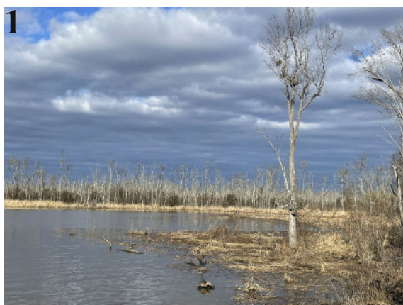
1. View of the marsh