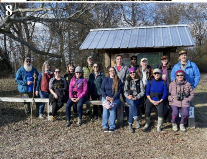
8. We had about 16 people at the field trip.