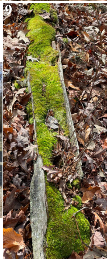
9. There was moss along the trail, this batch was growing in a decayed tree.