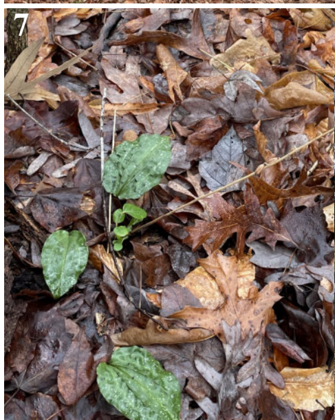
7. Cranefly orchid ( Tipularia discolor ).