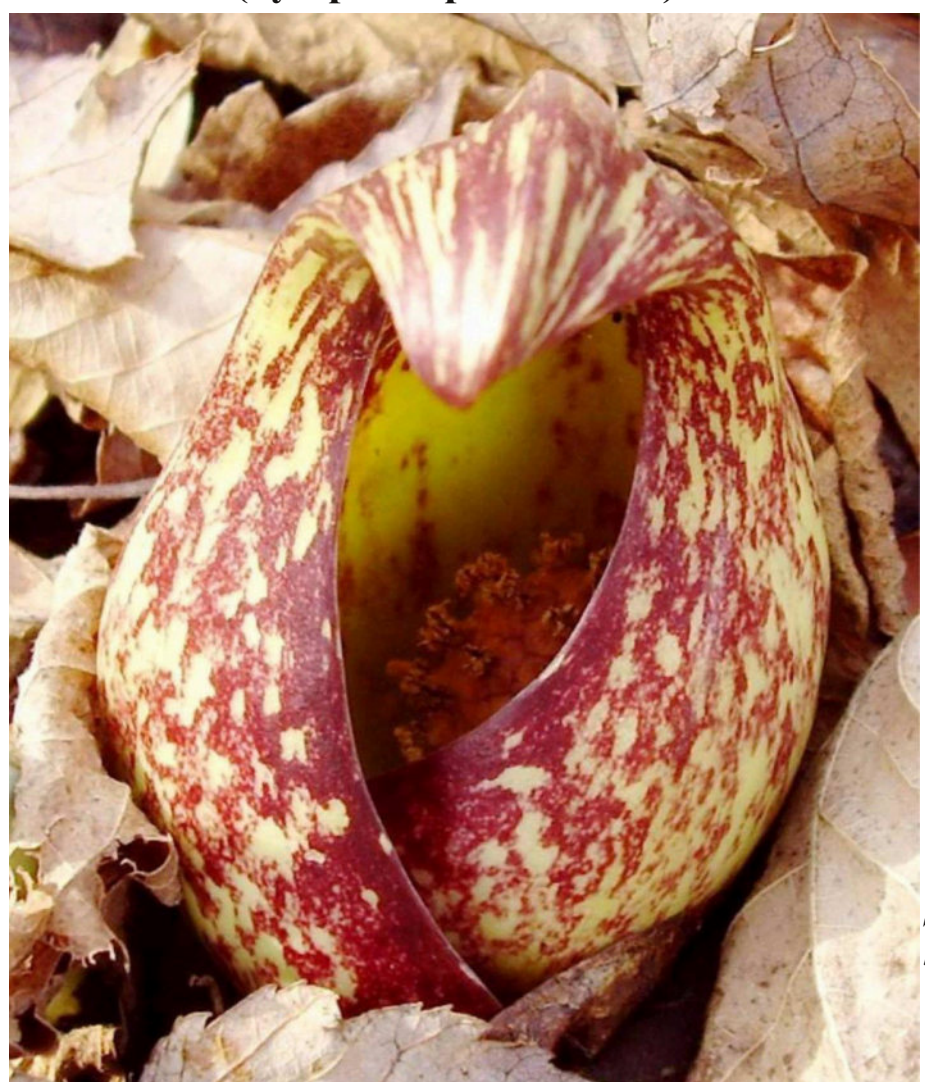
Skunk cabbage in bloom, Richard Moss

Skunk Cabbage is a large-leafed member of the Arum family that grows in wet areas, especially near streams, ponds, marshes, and wet woods. It gets its name because the crushed leaves of the plant emit a distinctly skunk like odor. It is one of the first plants to bloom in the Spring, and can bloom anywhere from February to May and is unusual in that the flowers generates significant metabolic heat which can raise the flower temperature 25 degrees above ambient temperature. Several hypothesis have been proposed as to why the plant does this, including protecting the flower from freezing, acceleration of growth to allow early season flowering, attraction of pollinators by vaporizing attractants and providing shelter and warmth for potential pollinators. Any or all of these could be true. If skunk cabbage is blooming in snow, the heat generated can melt the surrounding snow (Photo 1). The first part of the plant to appear is the spathe which is an odd looking brownish-purple, shell-like pod with green splotches. As the spathe gets bigger, it will reveal another part inside, called a spadix. The spadix is a little knob covered with small yellow flowers. Like many other dark-colored flowers, skunk cabbage is pollinated mostly by flies. The seeds mature by the end of the growing season and some may sprout next to the mother plant producing