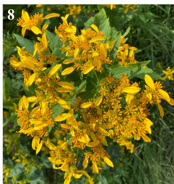
Figure 8. is a closeup of the crownbeard flowers. Along the trail through the meadow we found: