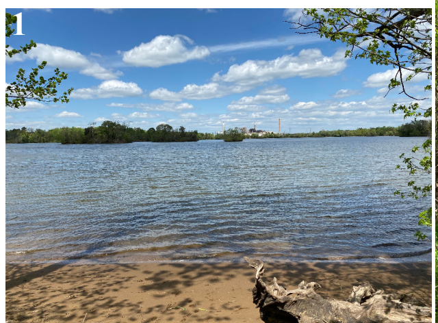
1. View across the lagoon. 2. Detail of the bark of a hackberry tree ( Celtis occidentalis ). 3. Cut Leaf Toothwort ( Cardamine concatenata ). 4. May apples ( Podophyllum peltatum ). 5. Jack in the pulpit ( Arisaema triphyllum ).

More from the Dutch Gap conservation area.