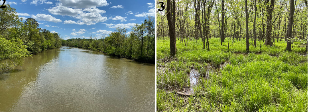
1 . Map. 2. Connection between the lagoon and the old river chanel. 3. Sedges growing beneath trees in a wet area.